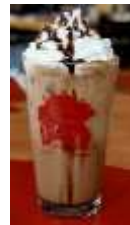
Iced Mocha Latte with Whipped Cream

Cappuccino - Made with frothed milk and White Mountain Gourmet Espresso...$5.25