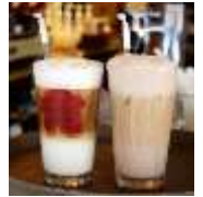
Maple and Chocolate Nitro Cold Brew Latte

Nitro Cold Brew Latte - Nitro Cold Brew Coffee, Milk, served on ice. Choice of flavor: Maple or Chocolate $5.50