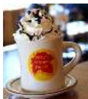
Peppermint Hot Chocolate with Whipped Cream

Upgrade to Homemade Maple Whipped Cream +1.50 Side of Oat Milk 1.00